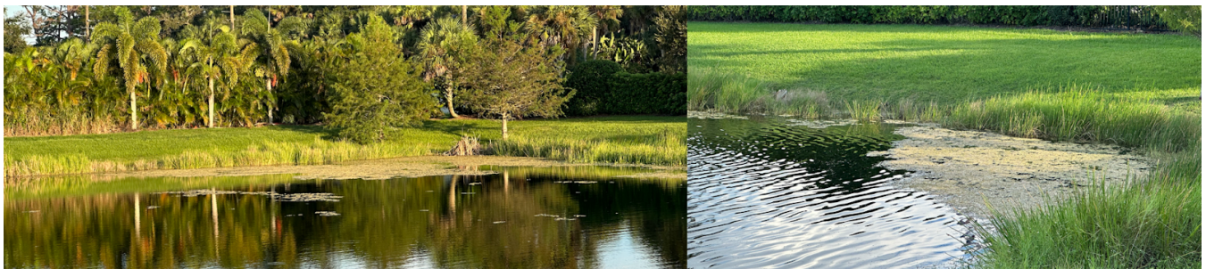
Today, the Algae is breaking up and drifting to the edges.