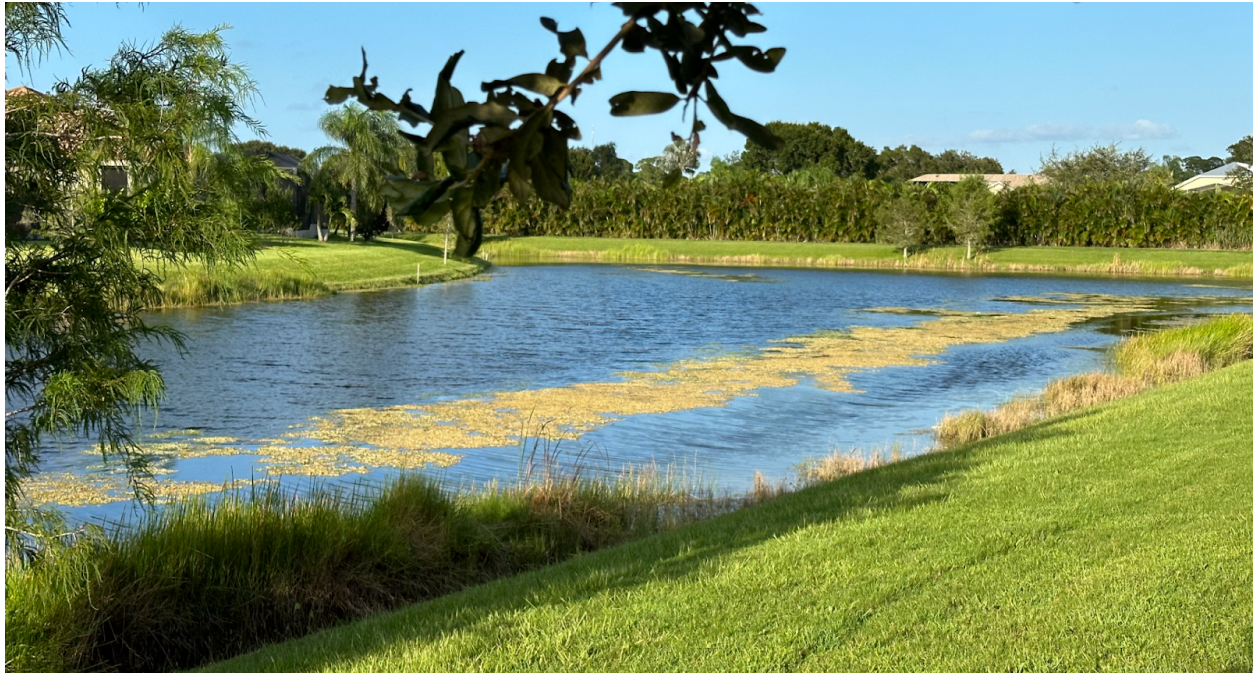
Looking from the sidewalk when first reported